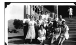
1932 Staff in front of Dodge Hall

No, please remove my name from your mailing list.