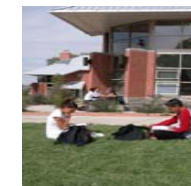
Students in front of Bates Hall

Tear off the survey portion and return to Admissions Office Navajo Preparatory