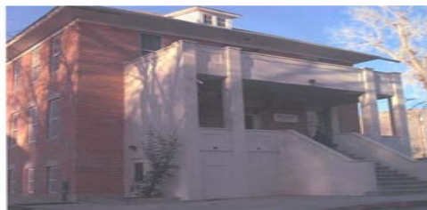
Dodge Hall—undergoing renovation