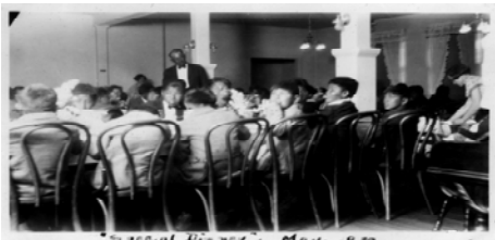
Students in the Cafeteria Navajo Methodist School.

What can NPS do to improve its college preparatory program? _____