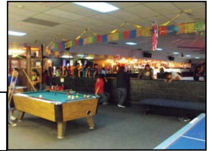
Students enjoying a trip to Skate Way