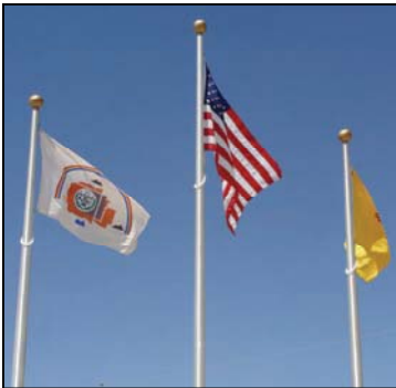
Above: Flags were raised on the new flag poles during the back to school staff orientation.