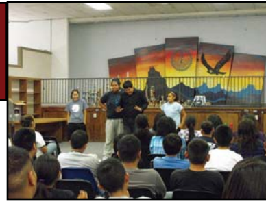
Student ambassadors talking to new students about experiences at NPS