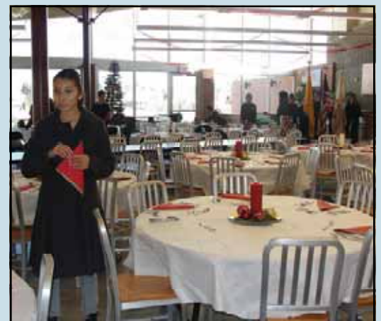
Student from the Life Skills program helped set up for formal dining.